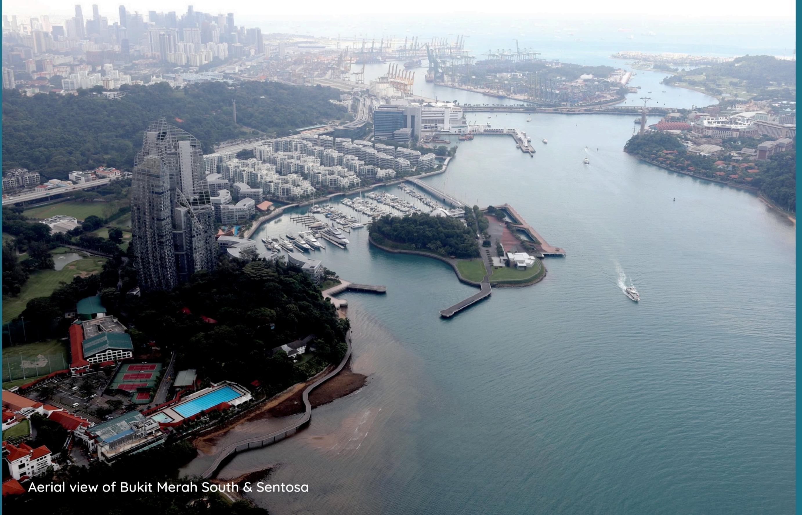
Aerial view of Bukit Merah South & Sentosa

Our towns are planned to be liveable and self-sufficient, with easily accessible shops, health care, schools, community facilities and parks. Commercial nodes, industrial estates and business parks within or nearby the town, also help to provide nearer job opportunities for residents. The detailed planning and implementation of plans for each town is a joint effort of many government agencies.